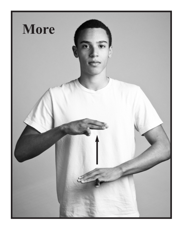
With little finger and thumb folded under middle three fingers, motion one hand up towards face, away from other hand.