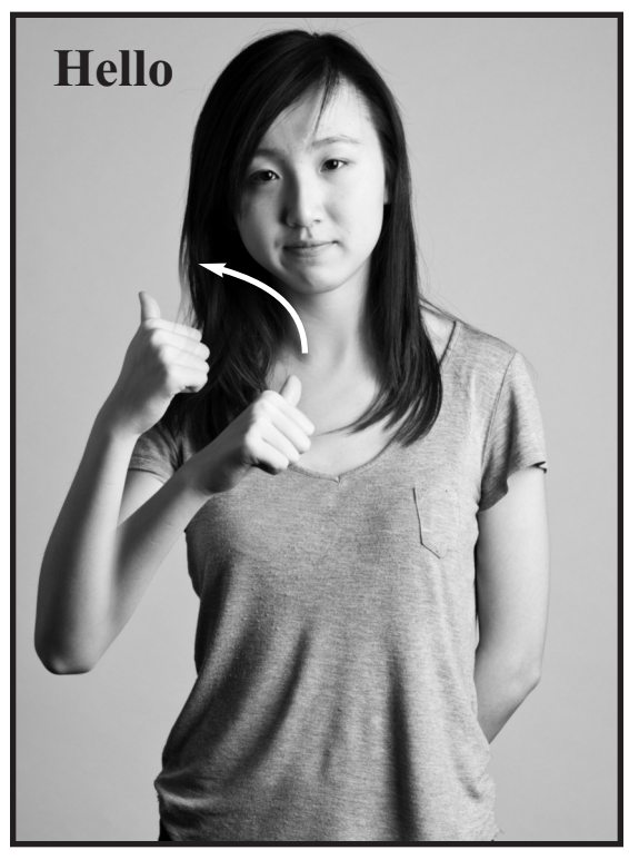
With hand in the "thumbs up" position (making a fist, with thumb kept up), rotate hand upwards 180 degrees.