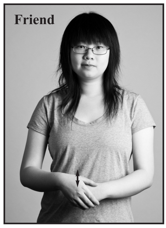
Place one hand on top of the other and shake slightly.